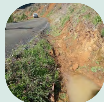
Drainage issue on road.