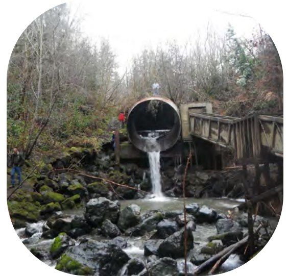
Baker Creek culvert.

Upcoming work: The culvert, fish ladder and fill material will be removed and the channel will be regraded in 2019. Habitat restoration will take place in 2020.