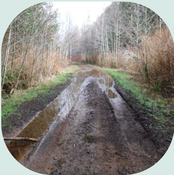
Example of poor road condition in Woodward Creek watershed.

Upcoming work: Road surveys will be performed and road improvements will be designed from this data. Road decommissioning and barrier placement will take place in 2019.