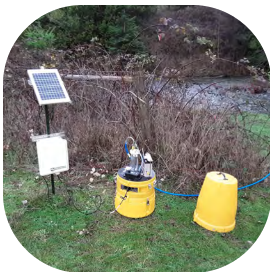
Automatic liquid sampler deployed on Dement Creek to evaluate sediment loading.

Upcoming Work: We will complete road surveys and continue our sediment sampling throughout the season. By mid-2019 we will compile all of our assessment results to plan and design restoration and road-improvement projects.