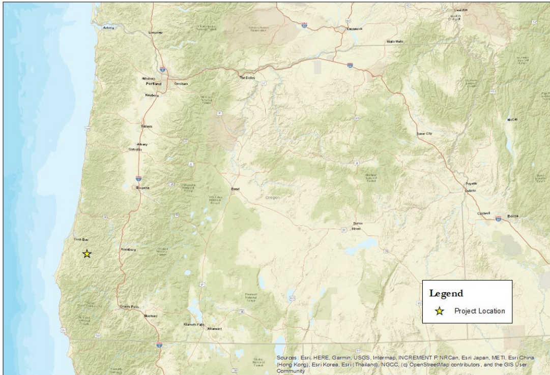
Figure 1 Project Location Map