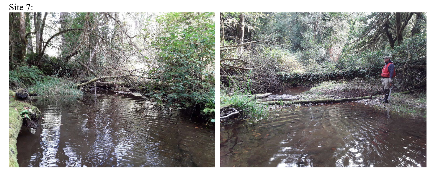
Figure 8 Upstream (left), downstream (right)