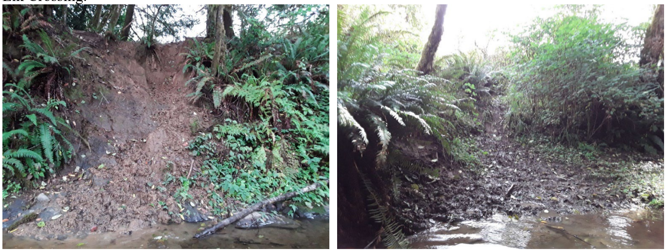
Figure 1 West bank (left), east bank (right)