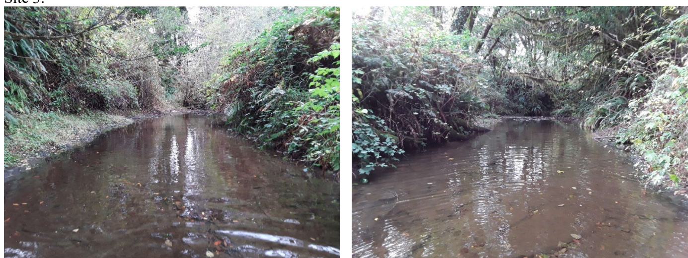
Figure 4 Upstream (left), downstream (right)