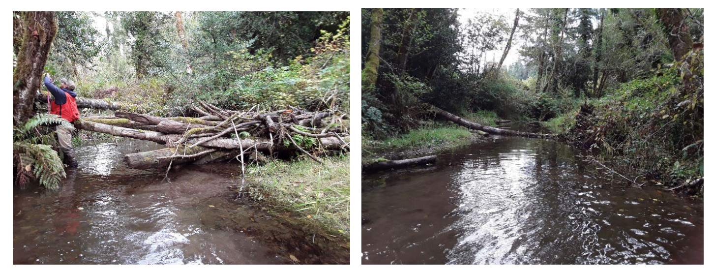
Figure 7 Upstream (left), downstream (right)