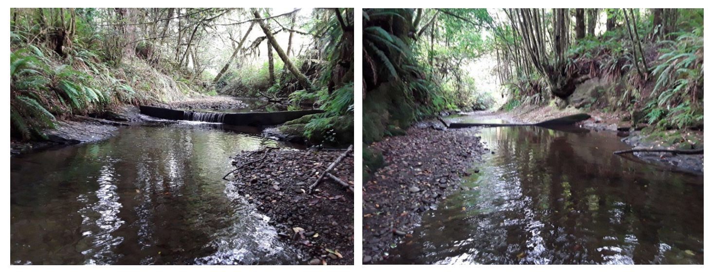
Figure 3 Upstream (left), downstream (right)