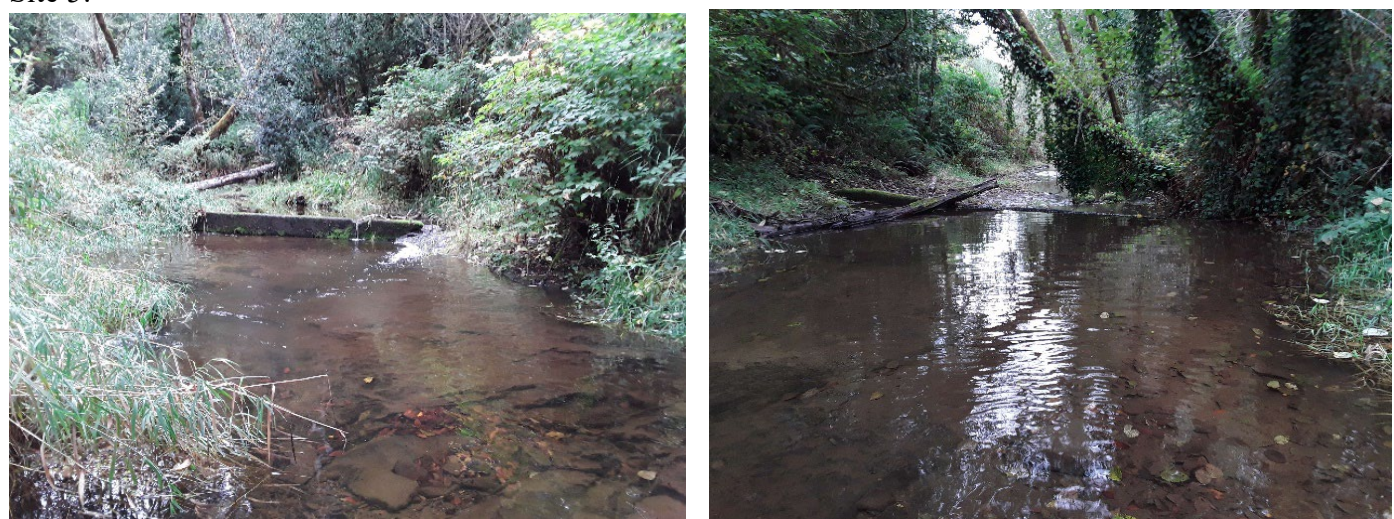
Figure 6 Upstream (left), downstream (right)