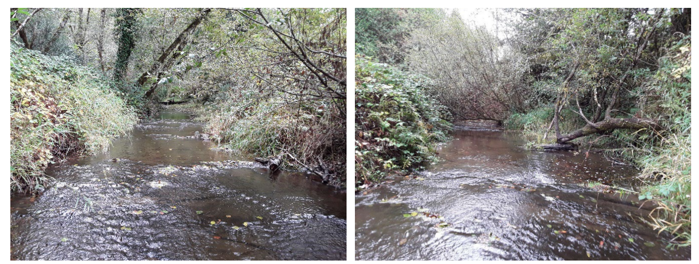
Figure 5 Upstream (left), downstream (right)