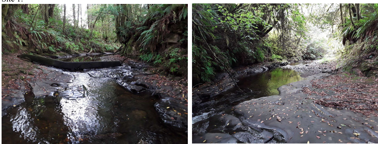
Figure 2 Upstream (left), downstream (right)