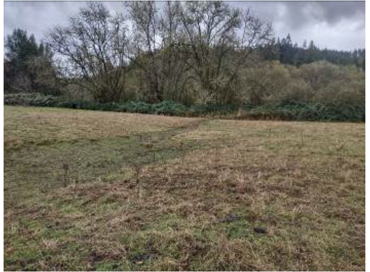
Photo 4 & 5: Swale in pasture. Flow of water from County Road Culvert #2 (Photo 4) toward the mainstem (Photo 5)