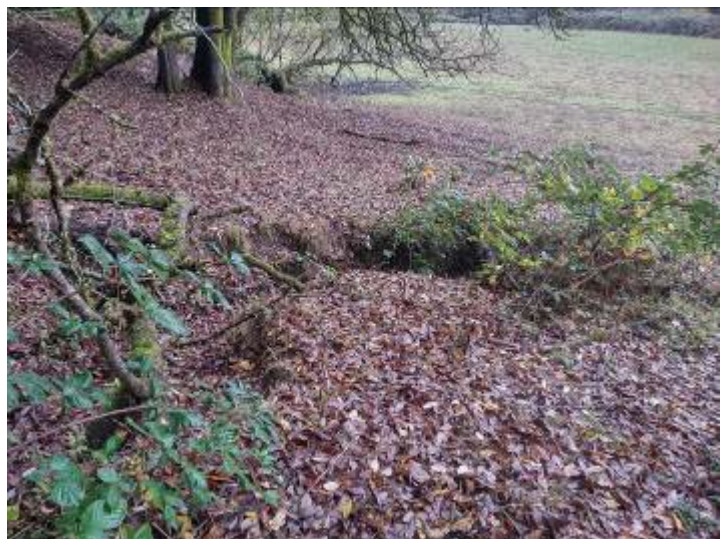
Photo 6 & 7: County Road Culvert # 3 (Photo 6) and flow of water into the ponded area (Photo 7)