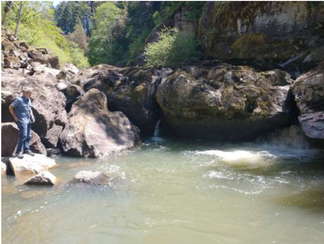
Figure 2. Looking upstream at Middle Fork Coquille Falls, with person for scale.