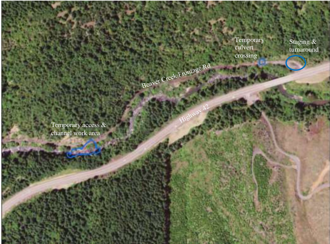
Figure 1: Aerial photo of project area.