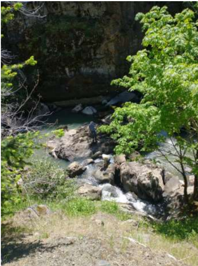
Figure 4. Falls location as seen from road.