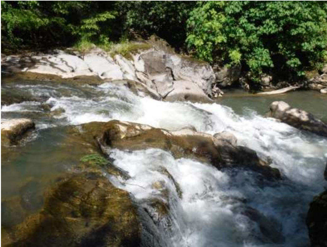
Figure 3. On top of Middle Fork Coquille Falls, looking downstream.